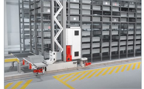
Storage and retrieval systems